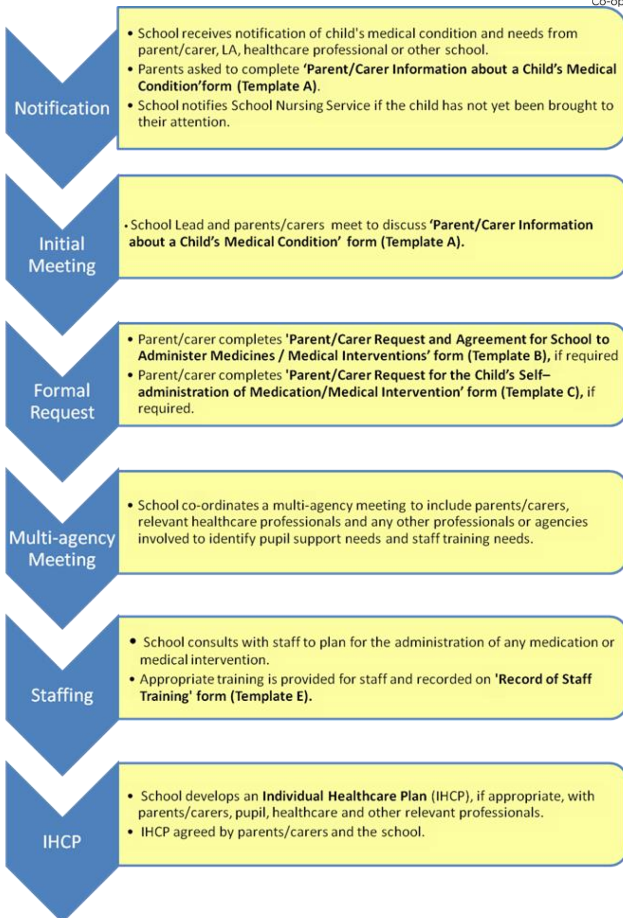
Individual Healthcare Planning (IHCP) Flow Chart